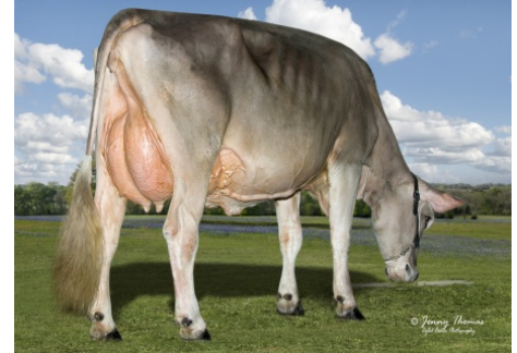
Dam: La Rainbow Sweet Silk ETV 'E90 E 91 MS' (2nd Lact)