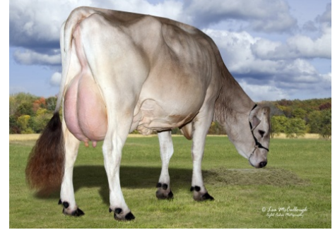
Dam: Kulp-Terra Cartel Cathy ET 'EX 90 EX 90MS' 2nd Lactation