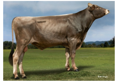
54BS573 LUCKY CARL