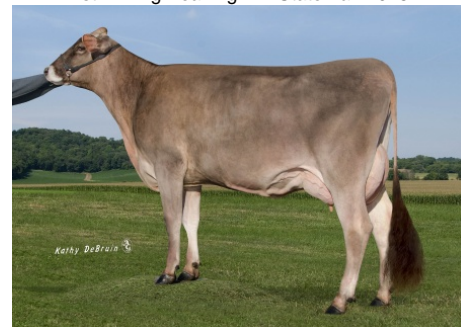
Triangle Acres Lucky Penny