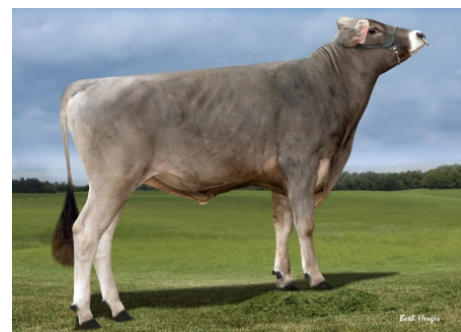
54BS557 GET LUCKY