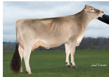
Hilltop Acres Lucky Dollar ET