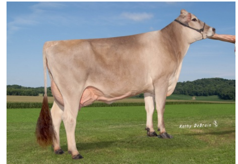
Cozy Nook Tonka Abbralee