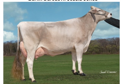
Dam: Hilltop Acres Bose Dixiland ET 'EX 90 EX 91MS'