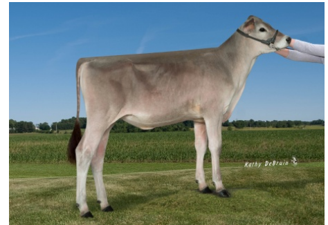
Jenlar Daredevil Trickster 1st Spring Calf WI State Show 2017