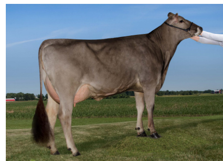
Dam: Nor-Bert Biver Sassy 'V87 88MS'

Sire: La Rainbow Sweet Silver ET Dam: Nor-Bert Biver Sassy 'V87 88MS' MGS: Scherma Blooming Biver *TM MGD: Nor-Bert Dbl Dare Sunshine 'V87 87MS' 3-01 305d 3x 32,900m 5.3% 1747f 3.6% 1199p