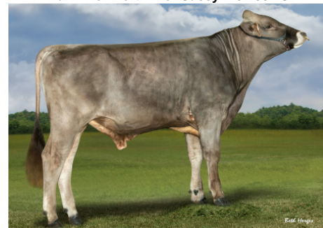
Pine Tree SVR SANDSTORM ETV