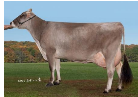
Dam: Switzer Tals Alibaba Davos 'VG 86 VG 86MS'